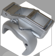
Femoral and Box Trial