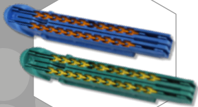
Surgical Staple Cartridges